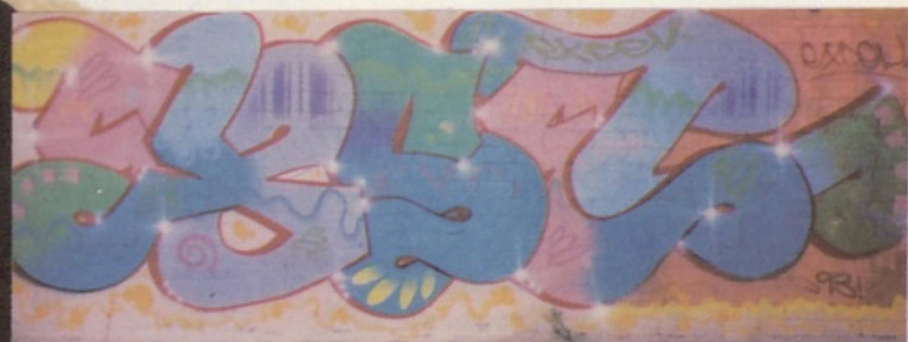
Excel Tucson, Az.