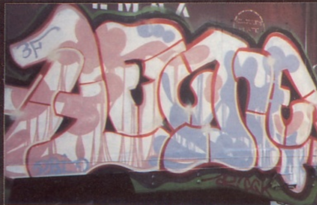
AE ONE Brooklyn, N.Y.