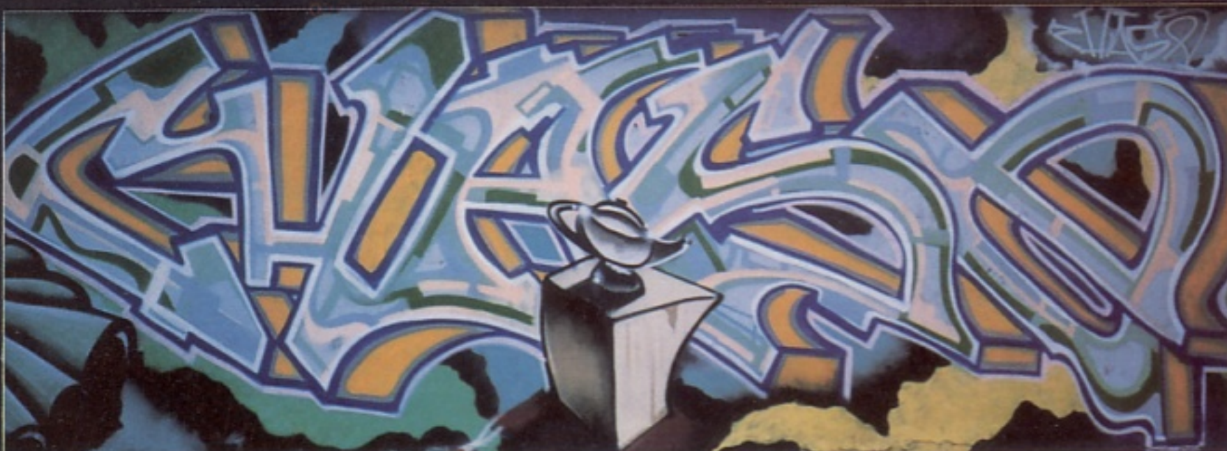
Chase Miami, Fl.