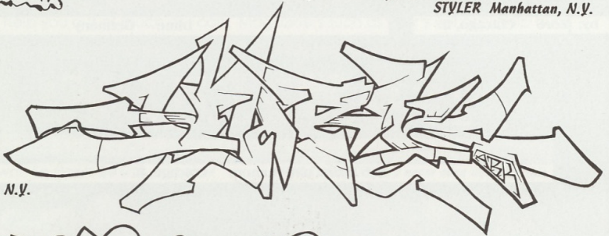
HARK Manhasset, N.Y.