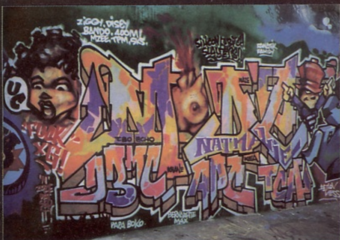
Mode 2 Paris, France