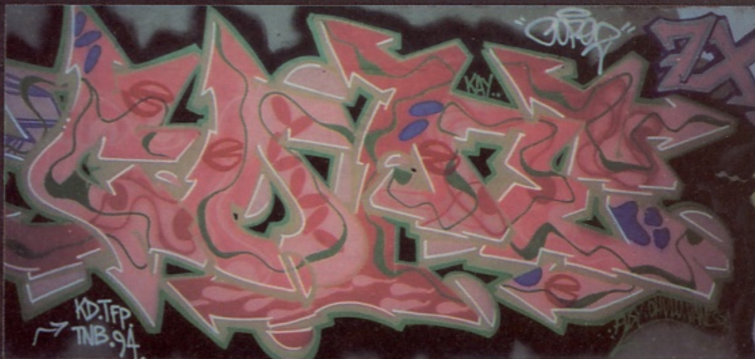
Cope The Bronx, NY.