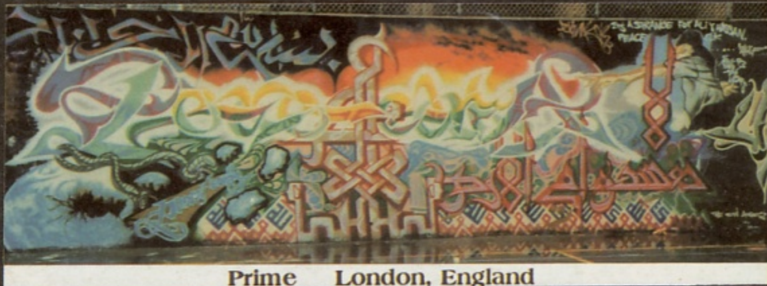
Prime London, England