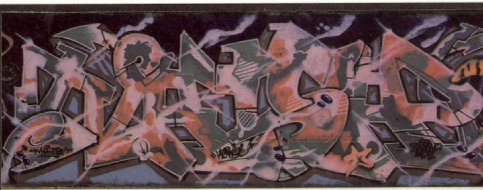
"Nasa" by: Kerse Huntington Beach, CA.