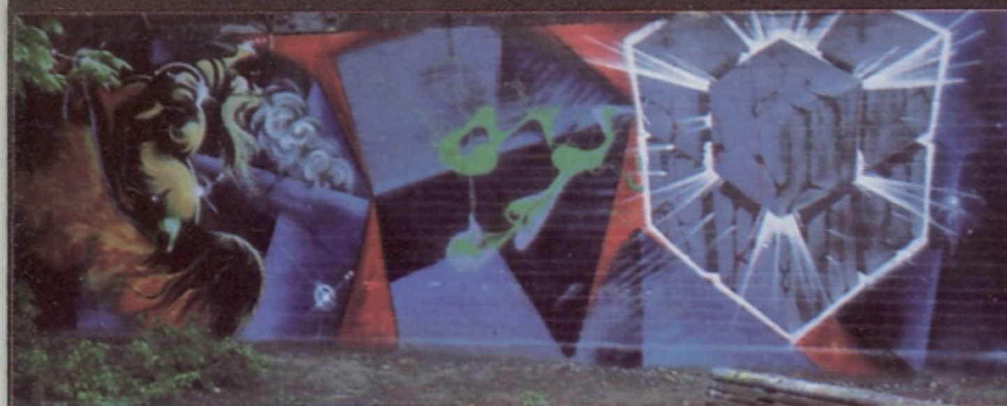
by: Cryse England