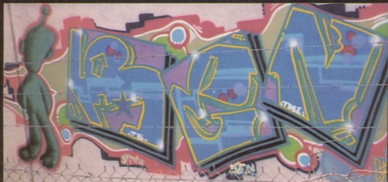
Ren Victoria, Australia