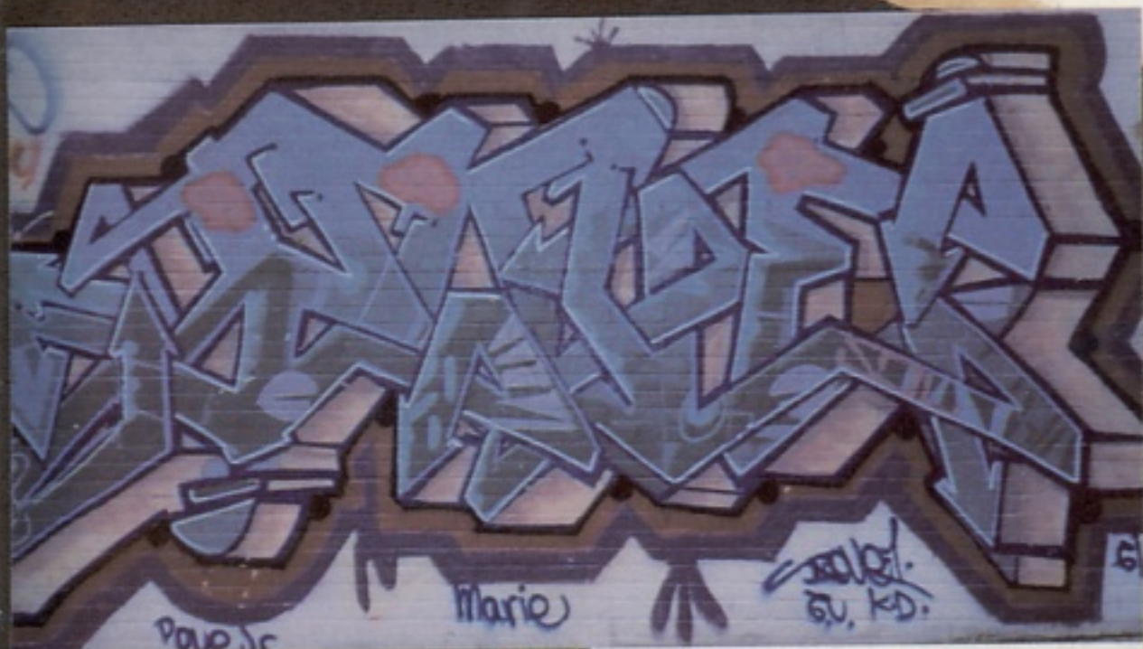
Pove The Bronx, NY.