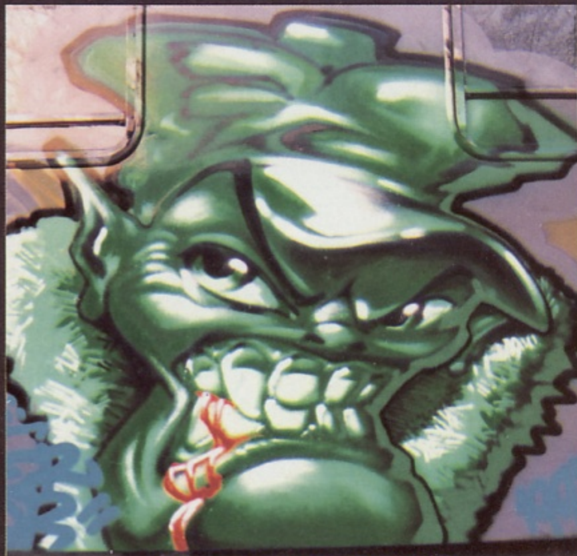
TZAK Barcelona, Spain