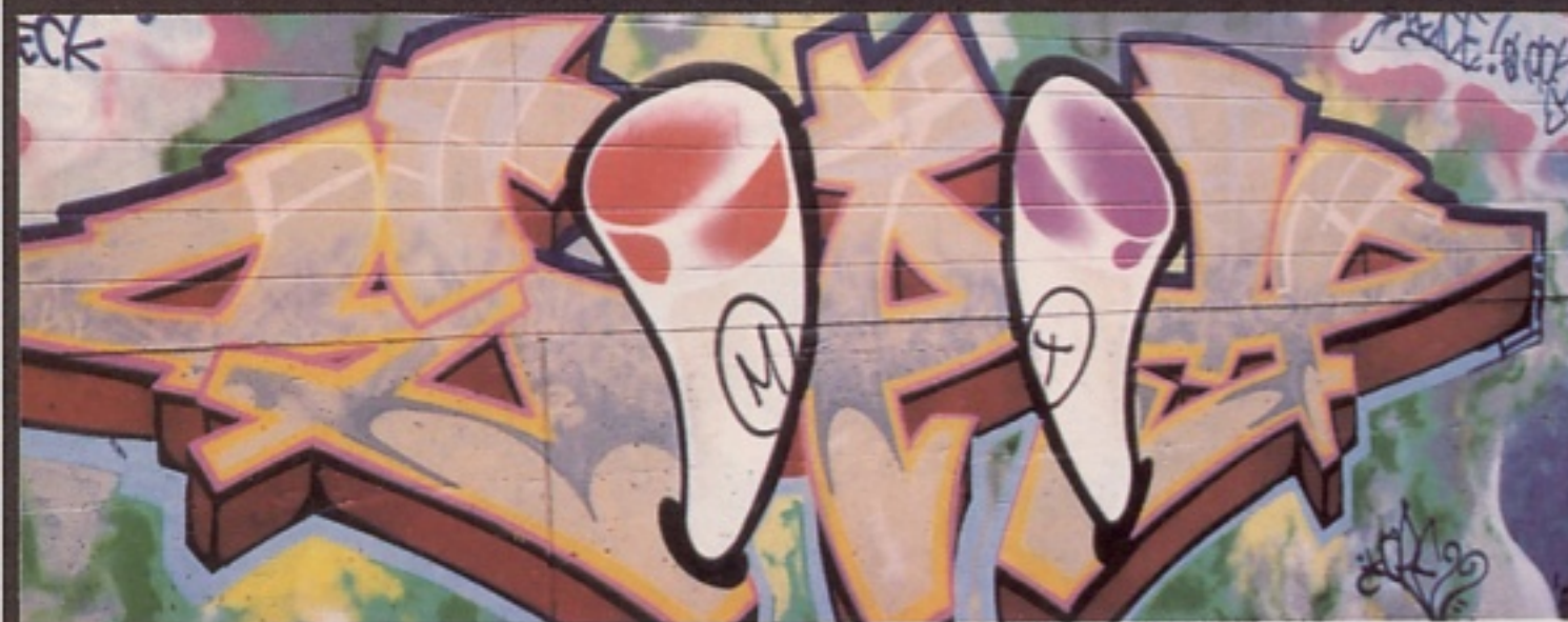
"Empty" by: Stain Canada