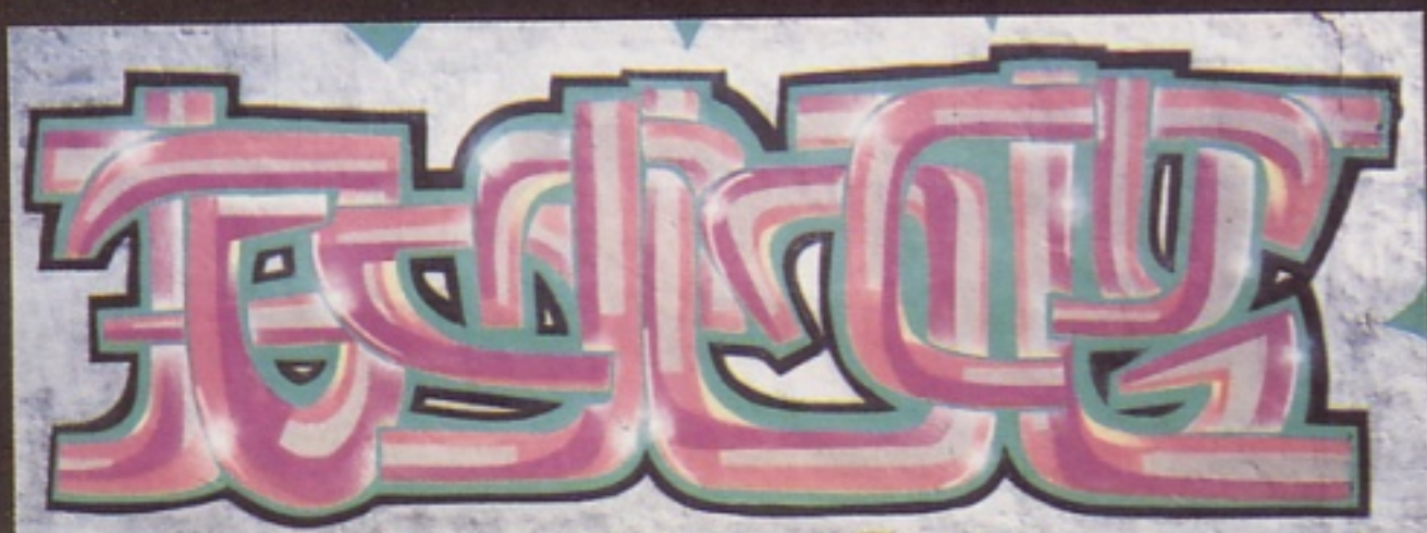
Moe Philadelphia, PA.