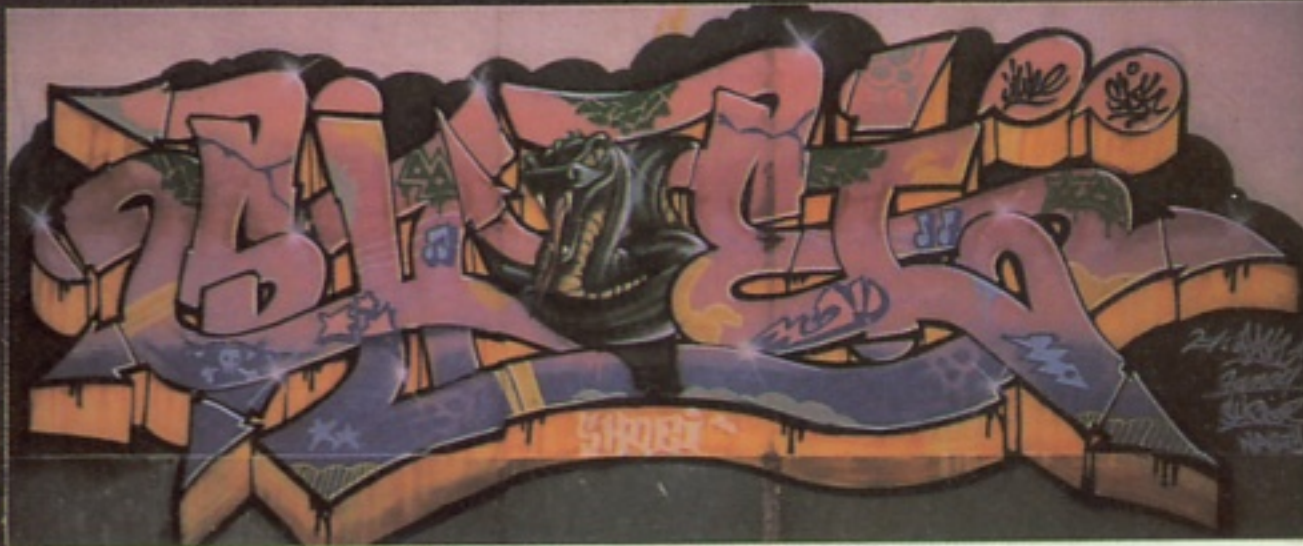
Shoei Paris, France