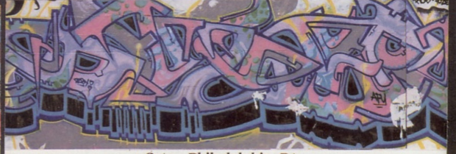
Sat Philadelphia, PA.