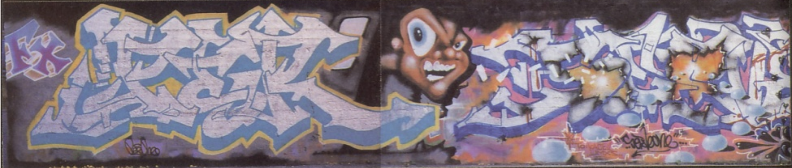
Per and Serve the Bronx, NY