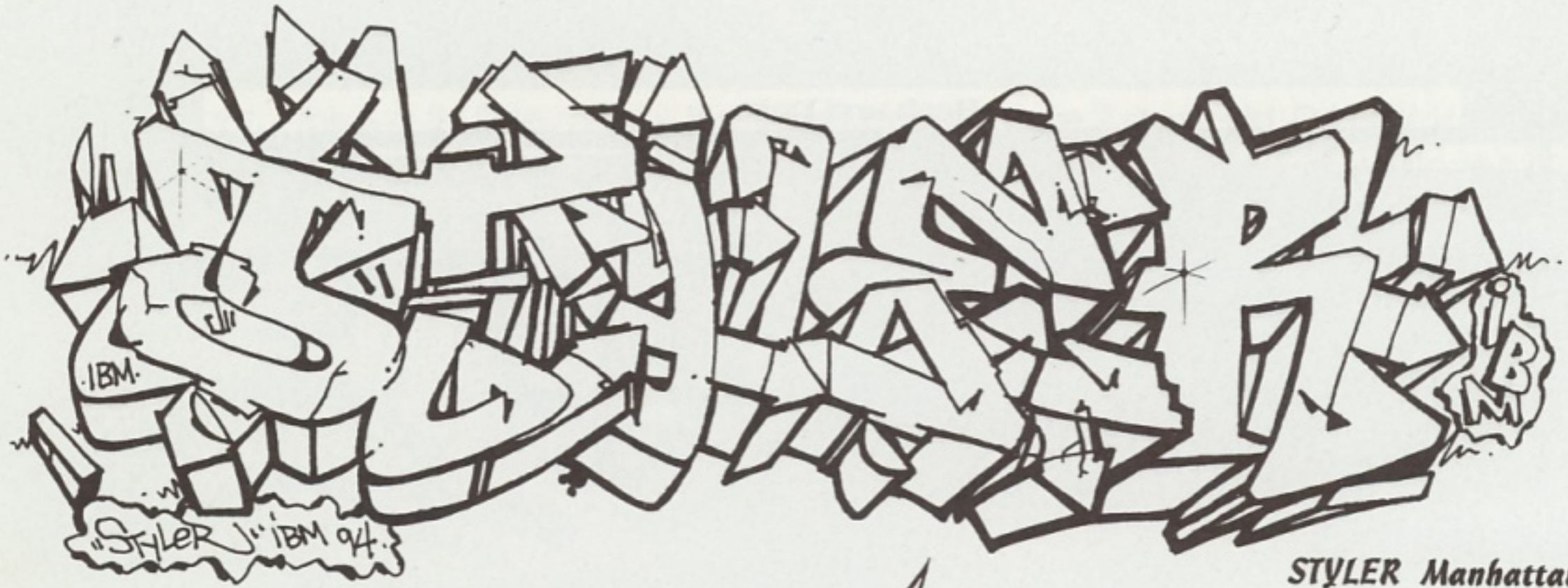
STYLOR Manhattan, N.Y.

Send in the outlines! It's preferable to have them on unlined paper, and done in black marker, rather than pen, or pencil.