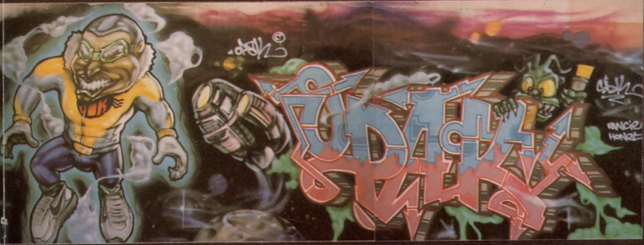
#4. "Space Groove" by: JIWEA, OPAK. Paris, France. #5. SABE, SIDE, BATES, MESK, JAME, RAIDE, characters by: CMP