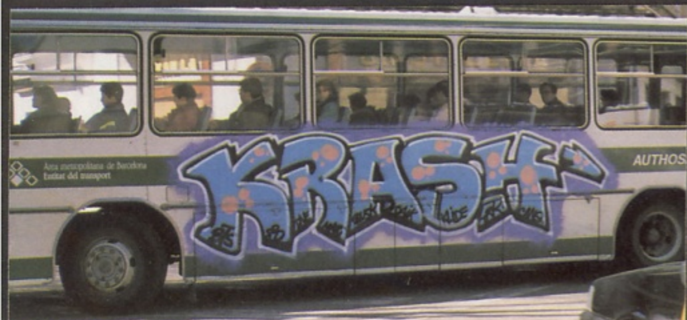
Krash Barcelona, Spain