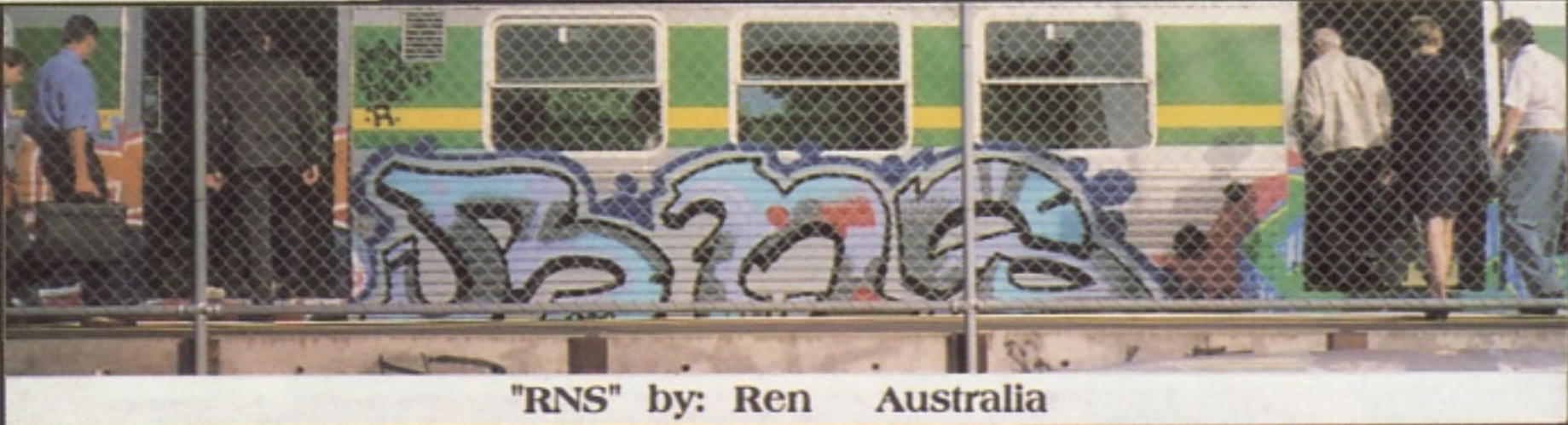
"RNS" by: Ren Australia