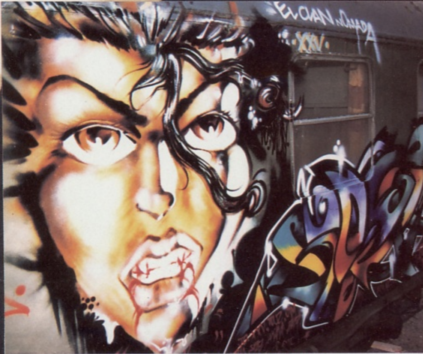
Poseidón Barcelona, Spain