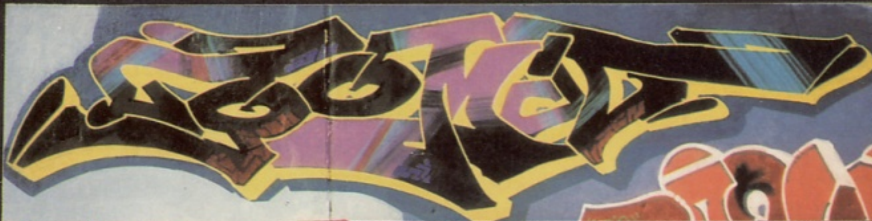
Loomit in Queens, NY.