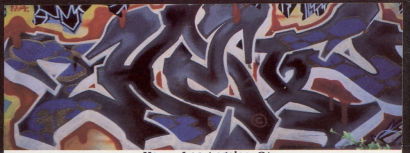
Hex Los Angeles, CA.