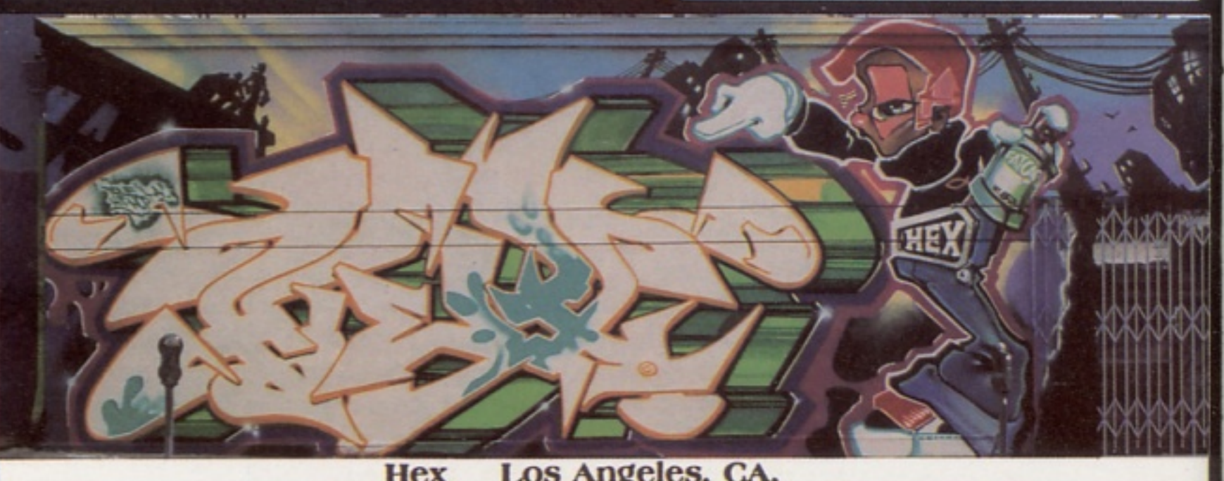
Hex Los Angeles, CA.