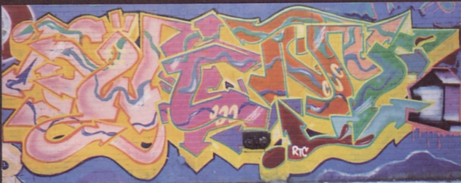
Wen The Bronx, NY.