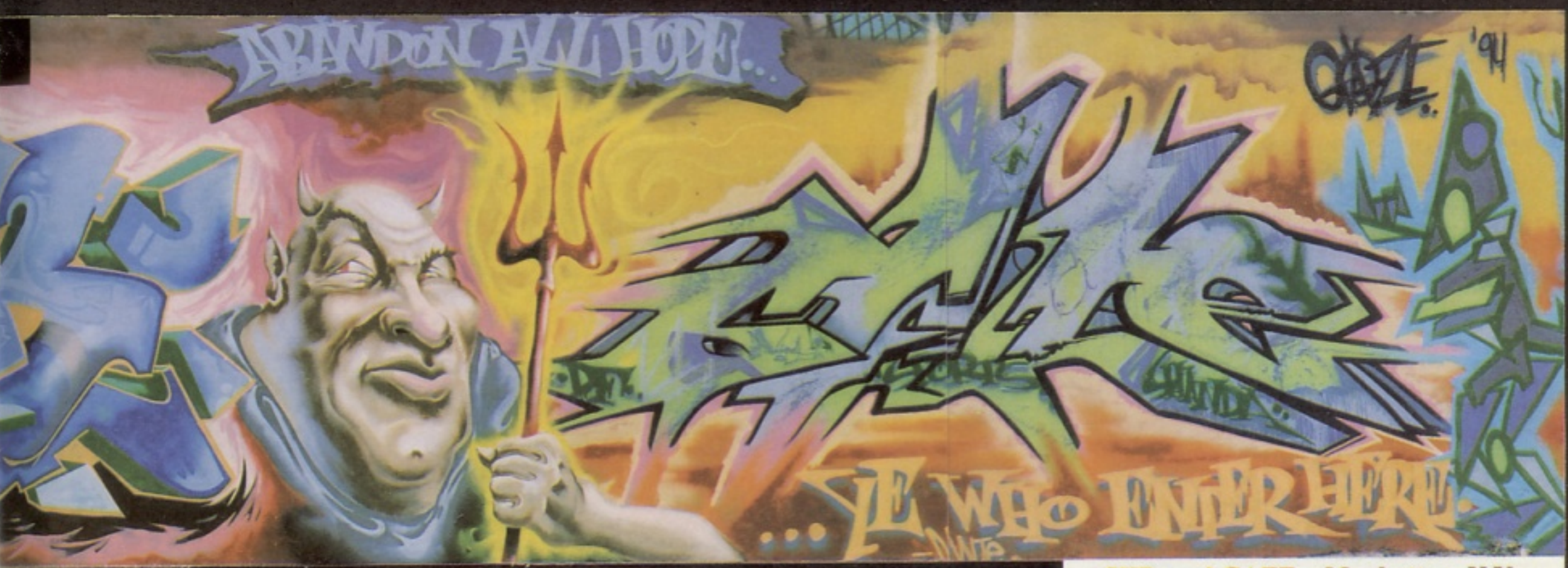
SUB, and GAZE Manhattan, N.Y.