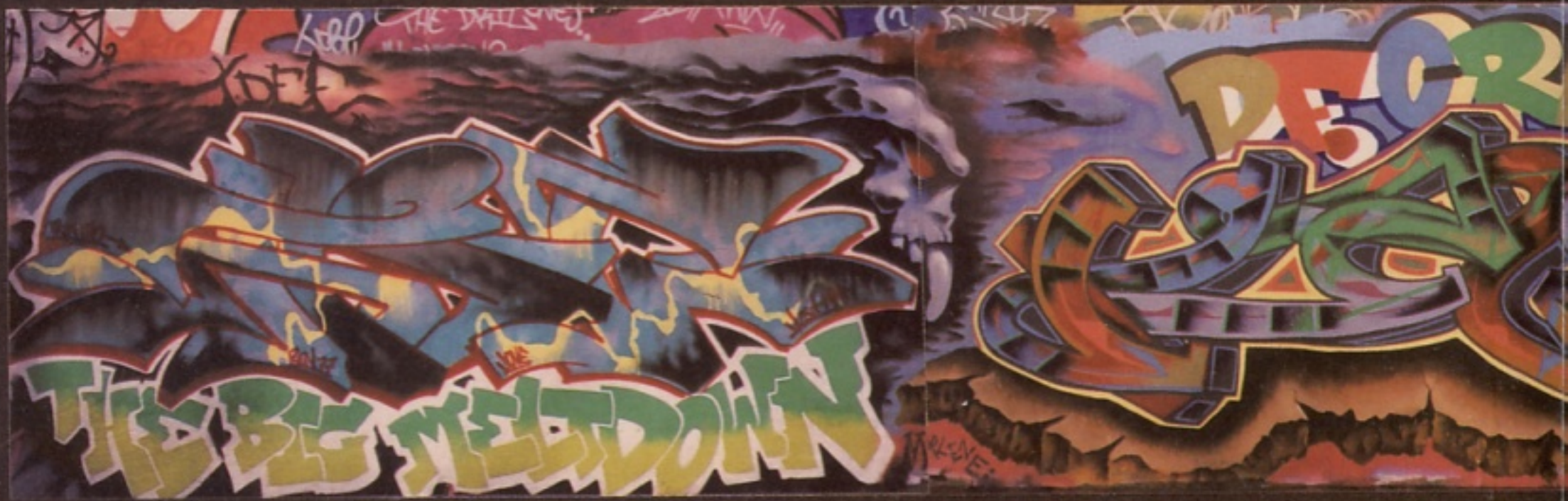
#1. "Trash can designs, Public Enemy" by: DAIM, and HESH. Germany #2.. SUMET, KRUSH Huntington Beach, Ca. #3. T.DEE, KAWS, SUB, characters by: WAQS Queens, N.Y.