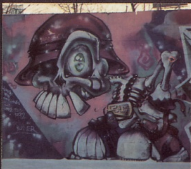
by: Zore Chicago, Il.