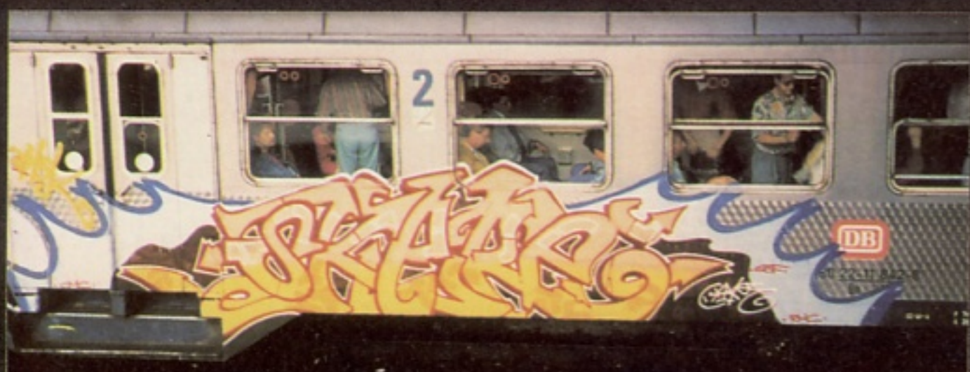
Skare Mannheim, Germany