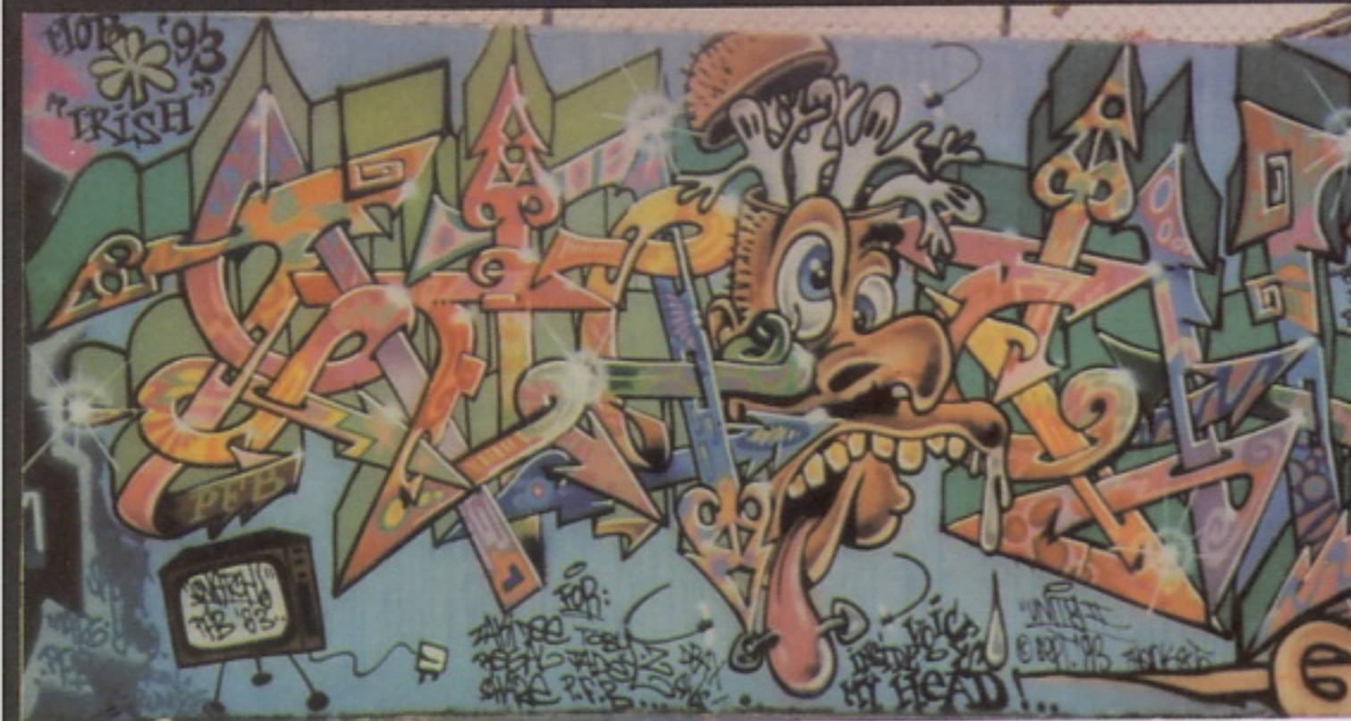
Snatch London, England