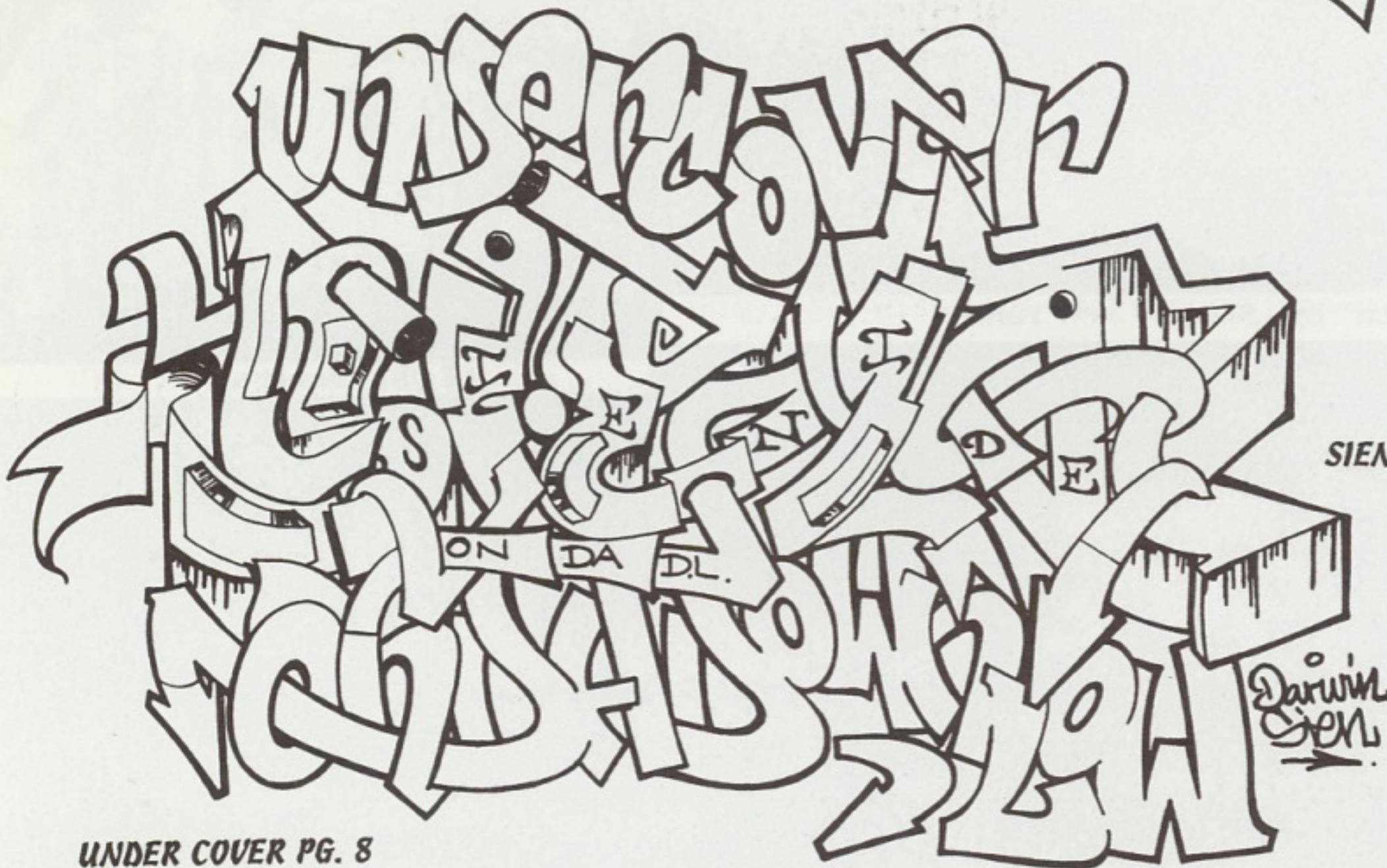
SIEM The Bronx, N.Y.