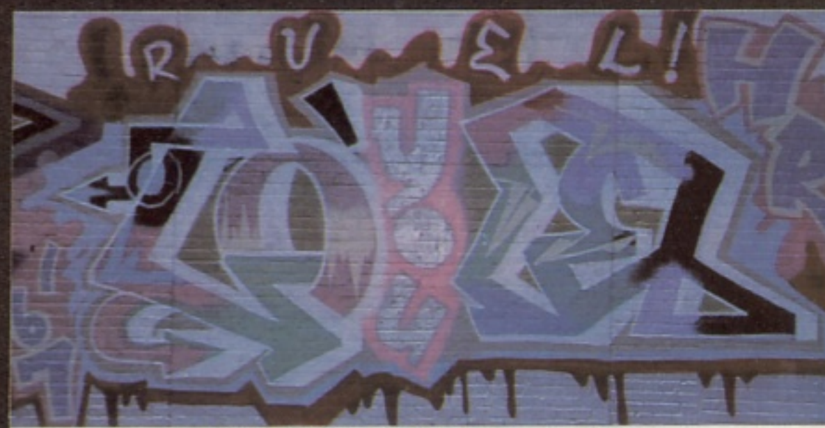
Louie 167 The Bronx, NY.