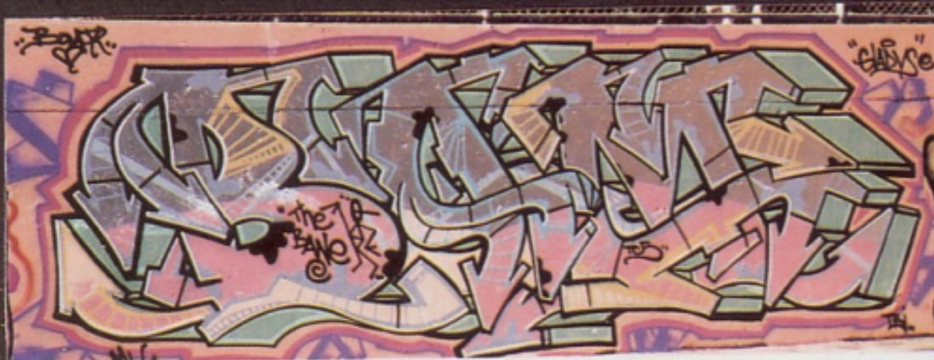
Bom 5 Manhattan, NY.