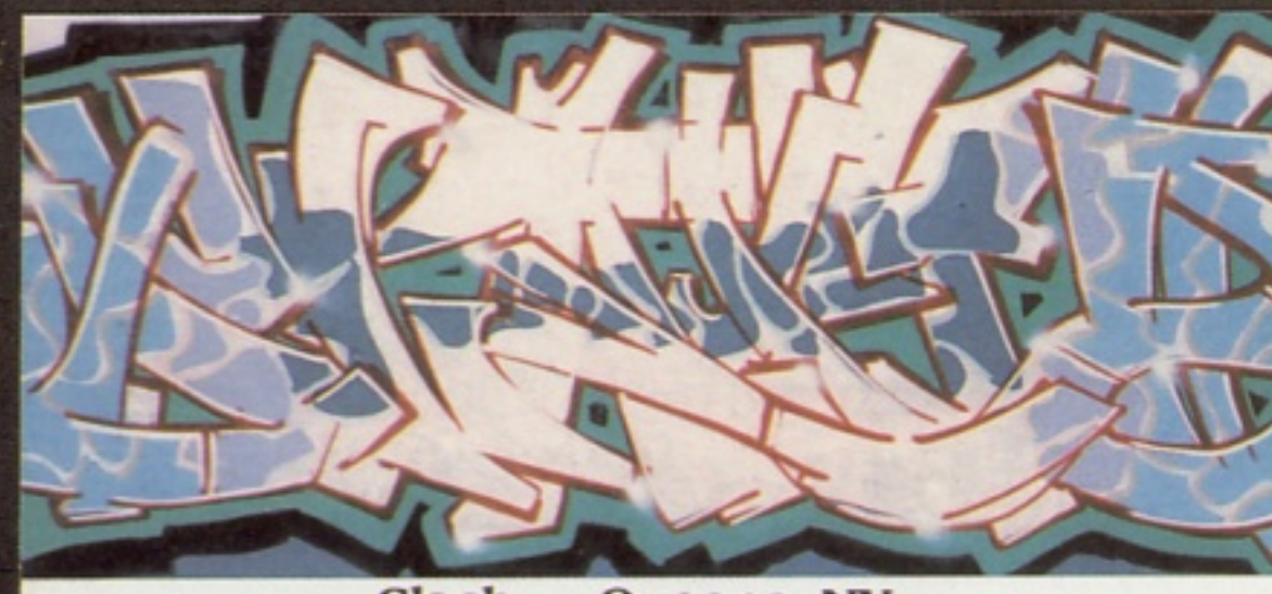
Slash Queens, NY.