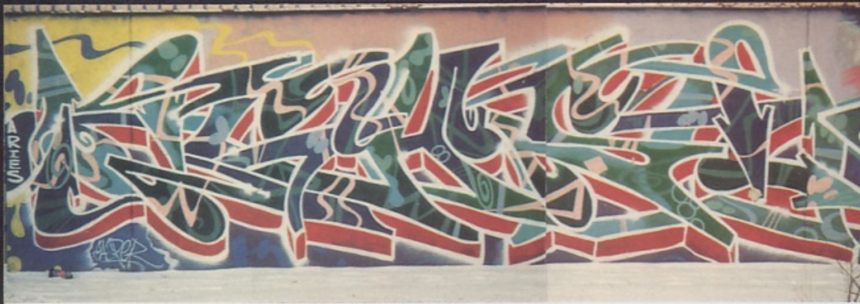
Casper Chicago, Il.