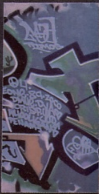
Puzler Melborne, Australia